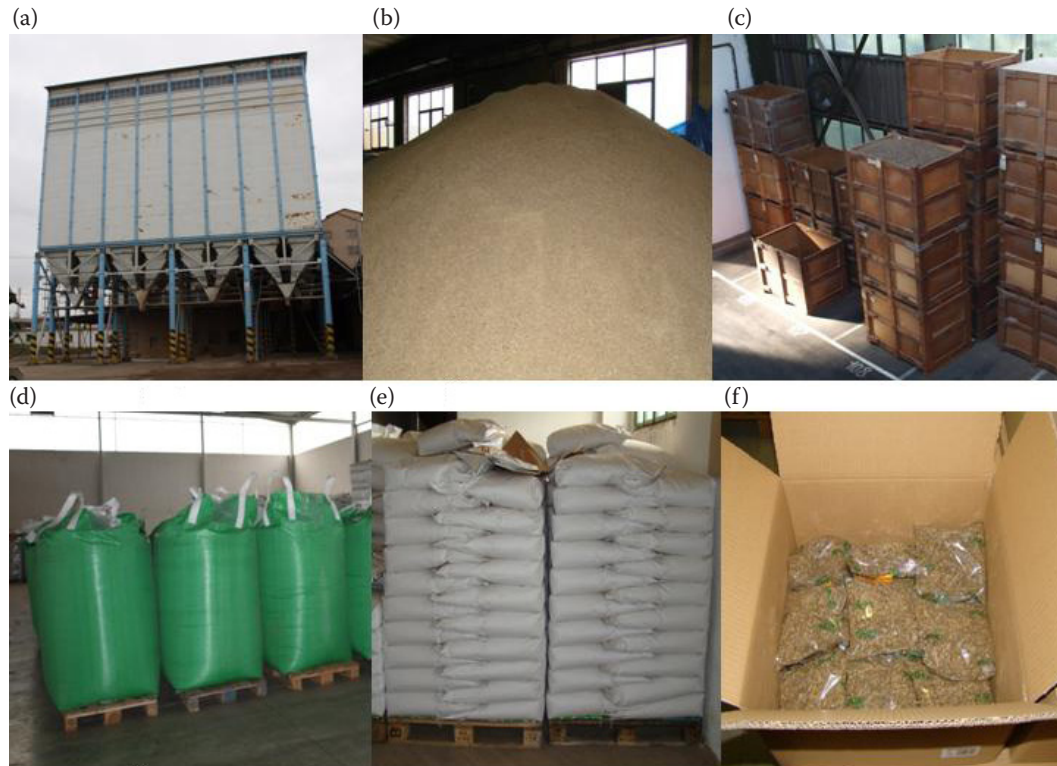
Figure 2. Most of the commonly used seed stores and packages are sensitive to attack of stored pest arthropods and rodents: (a) seeds in silos, (b) seed heaps in flat stores; (c) seeds in wooden boxes; (d) seeds in big bags (1000 kg); (e) seeds in medium bags (30–50 kg); (f) seeds in small bags (100 g to 5 kg) protected in paper boxes

We documented (STEJSKAL et al. 2003) a significantly higher infestation of stored wheat and barley by arthropod pests in flat stores than in silos in the CR. In the flat stores, the main risks for infestation are spillage and seed residues inside or in the vicinity of the storage buildings (KUCEROVA et al. 2003, 2005). According to personal communication from several anonymous Czech storekeepers, seeds stored in bags, large bags, bulk containers, and boxes are also sensitive to rodent (mice, rat) (Figures 1a,b) and bird (pigeons, sparrows) attacks. However, even grain stored in silos can be infested by roof rats ( Rattus